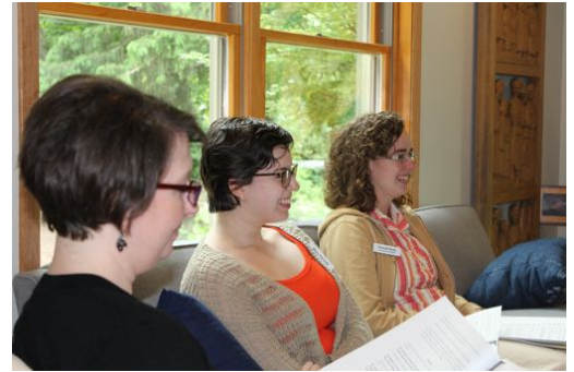
LDA deaconess students share a laugh during conversation at student seminar.