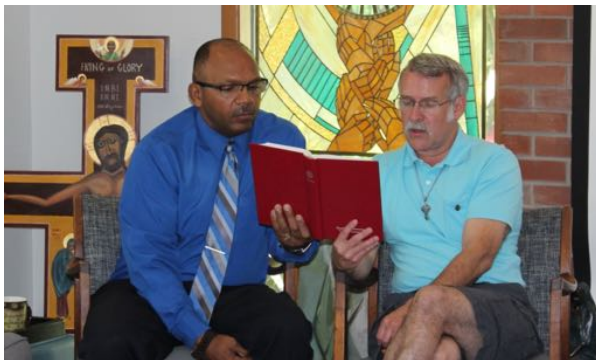
Two deacon students participate in worship, an integral part of the LDA's student seminar experience.

How is being a deaconess or deacon different than serving at camp or church? All people who reach out to others with care and compassion in a hurting world are practicing diaconal service. Some people desire to serve as a professional in ministry and enter a more formal training and formation process to become deaconesses and deacons.