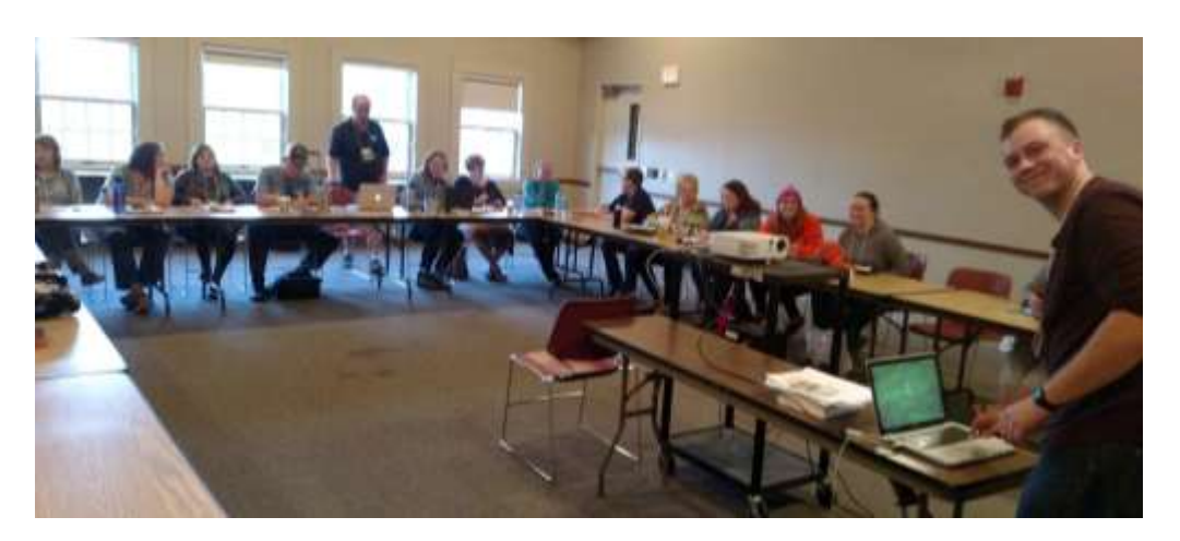
Getting ready for a session at "Welcome and Included"