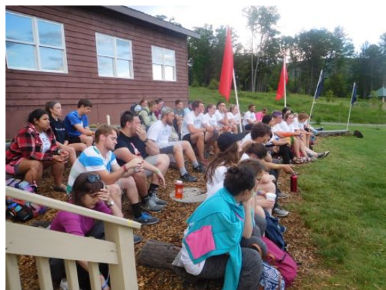
Camp staff from Mount Luther, Krislund, and Wesley Forest at their joint training day this past summer.

The three camps are planning six joint camps this coming summer, including the second offering of "Nomads." That program allows campers from all three camps spend a day at each camp, doing the best each camp has to offer.